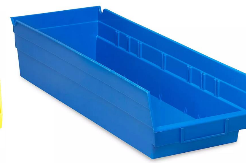
Medium Volume: 288 in 2