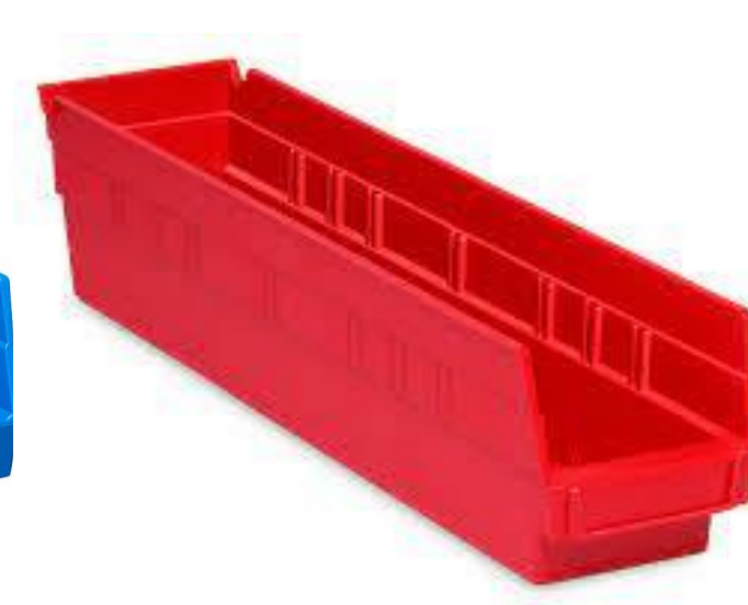
Small Volume: 144 in 2